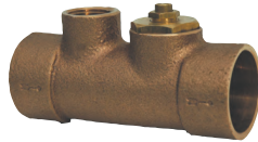
9121 Purge & Balancing • 3/4" through 1-1/4" • Bronze Body • Solder Ends