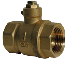
9123 Balancing Valve • 1/2" through 1" • Brass Body • Solder Ends