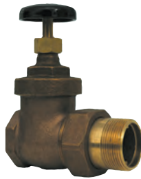
9107 Gate Valve • 1/2" through 1-1/2" • Bronze Body • FIP x Male Union