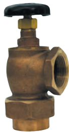
9109 Steam Convector • 1" & 1-1/4" • Bronze Body • FIP x Female Union