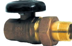
9125/9127 Circulator • 1/2" & 3/4" • Bronze Body • FIP x Male Union 9125 • Solder x Male Union 9127