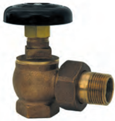
9101 Steam Valve • 1/2" through 1-1/2" • Bronze Body • FIP x Male Union