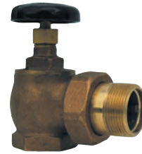
9103H Not Water Angle • 1/2" through 1-1/2" • Bronze Body • FIP x Male Union • Integral Bleed