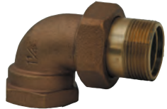
9150/9153 Union Elbows • 1/2" through 1-1/4" • Bronze Construction • FIP x Male Union 9150 • Solder x Male Union 9153