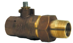
9126/9128 Slot Balancing • 1/2" & 3/4" • Bronze Body • FIP x Male Union 9126 • Solder x Male Union 9128

The 9100 Series radiator valves solve a wide array of applications issues. We offer steam shutoff and control valves as well as purge and balancing valves.