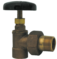
9105 Hot Water Angle • 1/2" & 3/4" • Bronze Body • Solder x Male Union • Integral Bleed