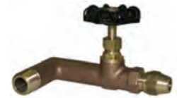
9133/9135 Oil Tank Valves • 1/2" • Bronze Body • MIP x MIP 9133 • MIP x Flare 9135

For application solutions, contact Red-White Valve or our representative in your area.